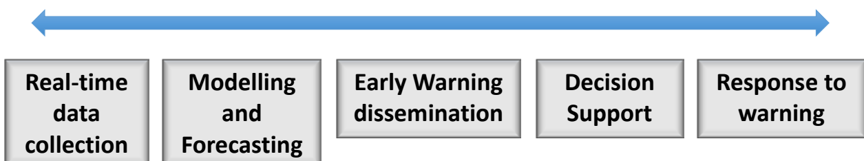
Figure 1. Steps of the Flood Forecasting Initiative

Task 4: by ensuring access to guidance material and training through the IFM HelpDesk .